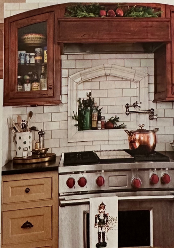
(Above left) The kitchen gets its vintage style from counter-to-ceiling cabinets, soapstone countertops and subway tile. (Above) Heather designed the glass-front pantry with sliding doors. “It looks like a little grocery store,” she says.