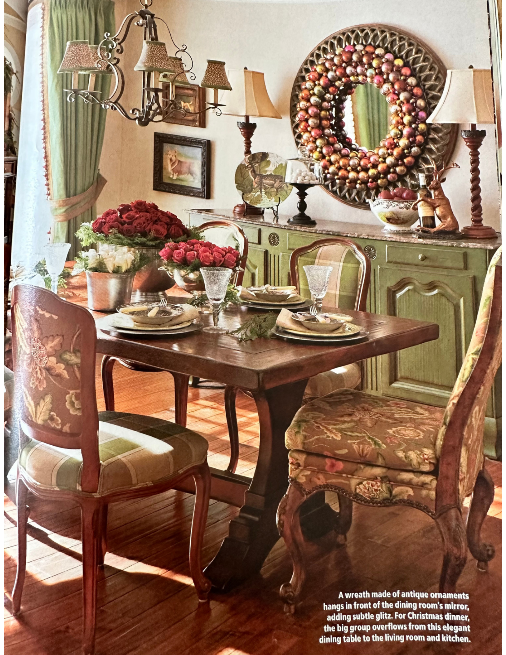
A wreath made of antique ornaments hangs in front of the dining room's mirror, adding subtle glitz. For Christmas dinner, the big group overflows from this elegant dining table to the living room and kitchen.